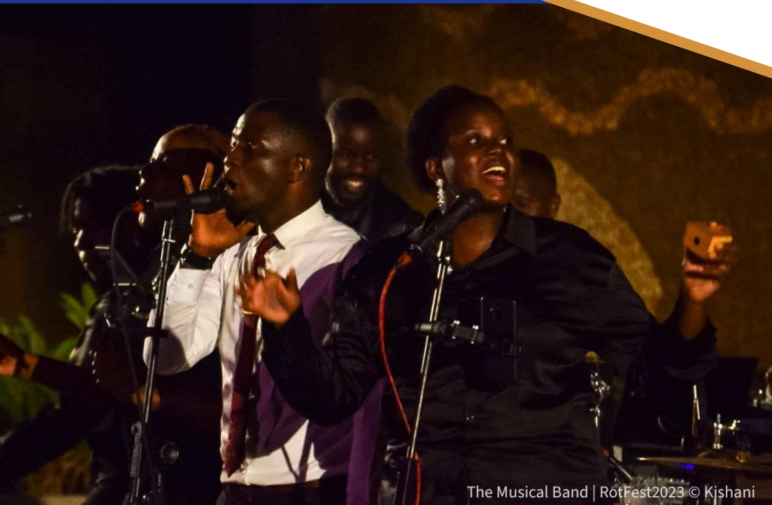
The Musical Band | RotFest2023